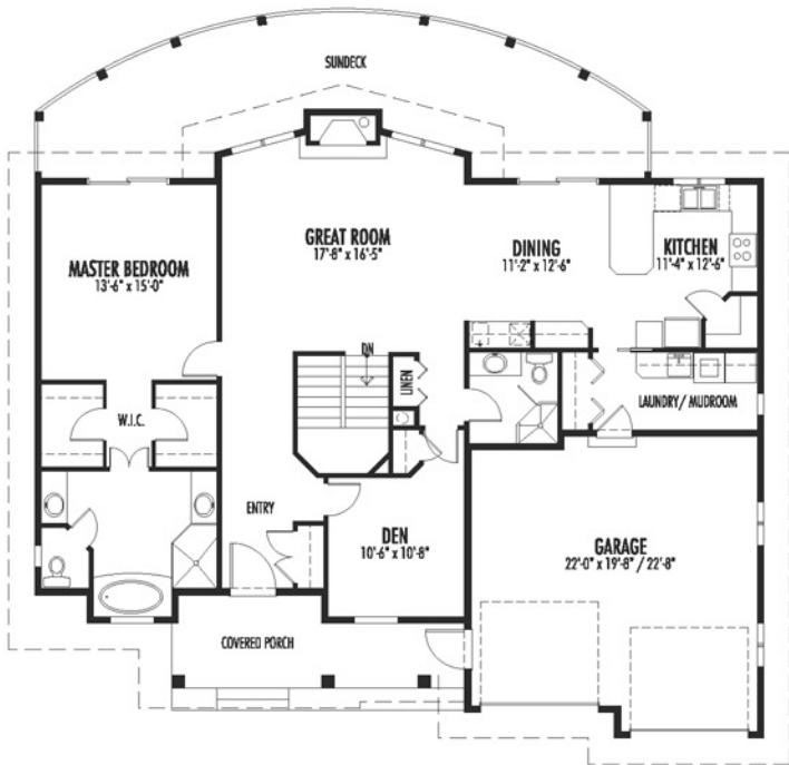
Main Floor 1637 sq.ft.